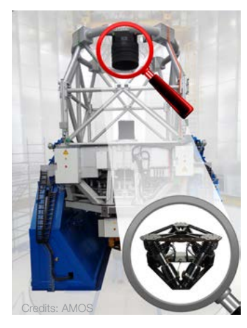
ARIES telescope is installed in Nainital in India. With a primary mirror of 3.6 m diameter, it is the largest optical centre in the country. Cross-coupling of SURES hexapod is less than 0.7 arcsec in tip-tilt during centering or focus.