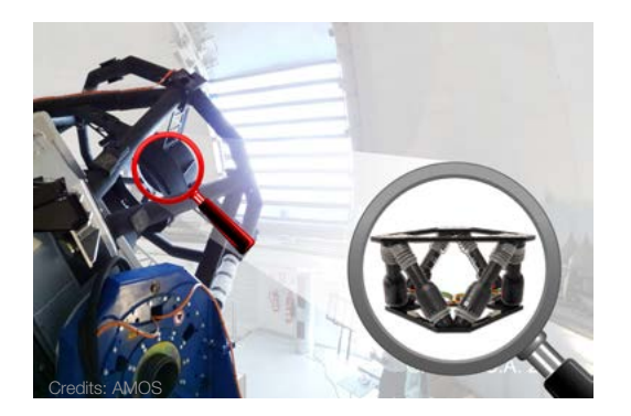
SURES hexapod positions the 450 kg secondary mirror of OAJ T250 telescope in Spain with 0.35 µm linear and 0.5 arcsec angular resolutions. The SURES hexapod for OAJ has a 920 mm diameter.