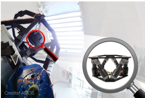
SURES hexapod positions the 450 kg secondary mirror of OAJ T250 telescope in Spain with 0.35 \mu\text{m} linear and 0.5 arcsec angular resolutions. The SURES hexapod for OAJ has a 920 mm diameter.