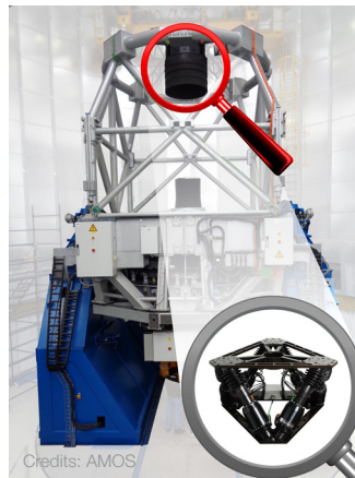
ARIES telescope is installed in Nainital in India. With a primary mirror of 3.6 m diameter, it is the largest optical centre in the country. Cross-coupling of SURES hexapod is less than 0.7 arcsec in tip-tilt during centering or focus.