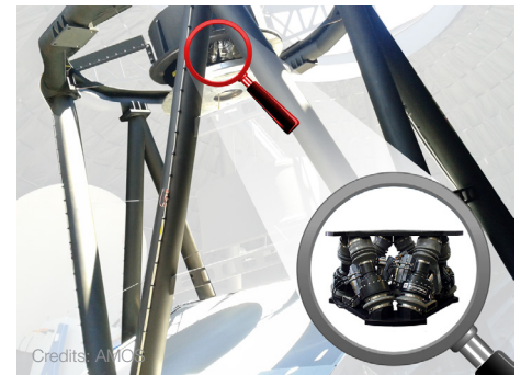
The hexapod is installed on Pan-STARRS-2 telescope at an altitude of 4267 m on Maui, Hawaii. A smaller version of SURES has been adapted as the secondary mirror is 600 mm diameter and weighs less than 110 kg.