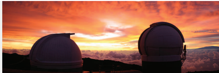
The PS2 and PS1 Telescopes on Haleakala