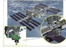
Hexapods for Space Station

Symétrie developed its first two hexapods to align the French infrared camera on the international James Webb Space Telescope, which will succeed the Hubble telescope in 2018.