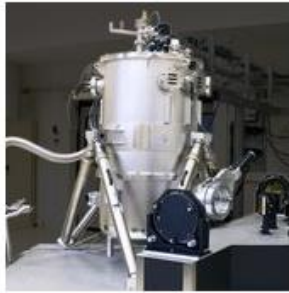
Hexapod for James Webb

"They are also being used to study how well antennas work on top of a moving vessel, such as a boat at sea."