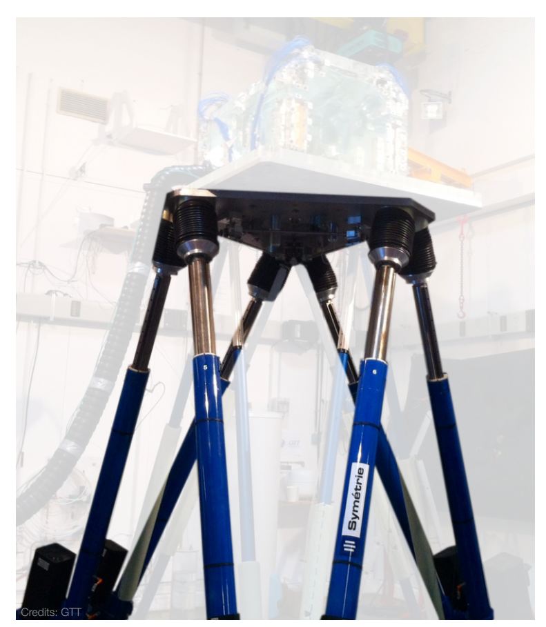
GTT designs cryogenic membrane containment systems used in the shipbuilding industry for the transport of liquid natural gas (LNG). SIROCCO hexapod allows GTT laboratories to study the impact of moving liquid, also called sloshing, on their insulation.