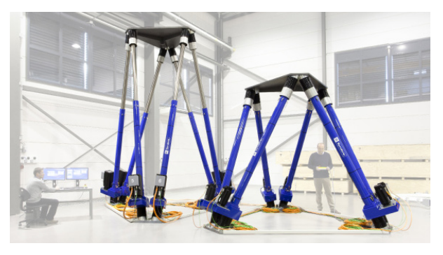
FMC Technologies uses two SIROCCO XL hexapods to test a ¼ scale LNG loading arm. These hexapods simulate the swell motion to qualify the loading arm that will connect a gas carrier to an offshore gas production factory. One hexapod simulates the gas carrier, the other the offshore factory.