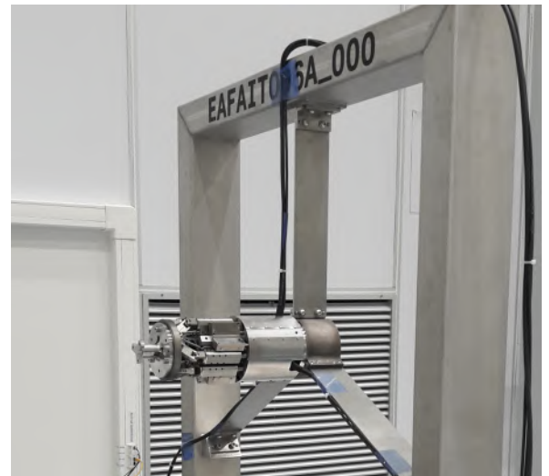
MAUKA hexapod has a very small diameter of 107 mm.