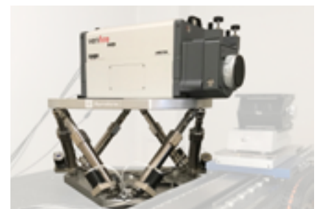
This ZONDA hexapod positions a laser interferometer (Zygo) in order to characterize the X-ray mirrors at Synchrotron SOLEIL.