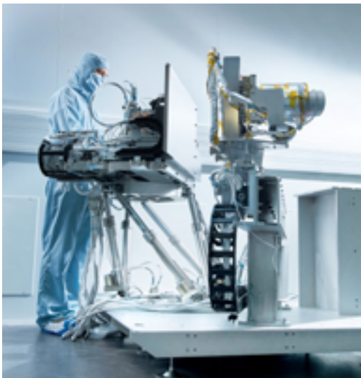
ISO5 clean room compatible hexapod to test space optical instruments for MTG (Meteosat Third Generation) satellites at BERTIN Technologies.