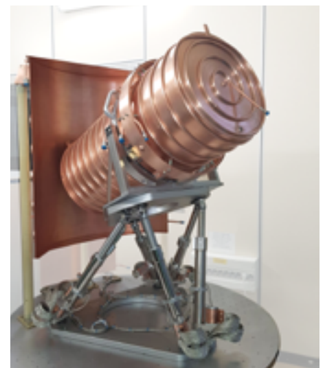
This HV ZONDA hexapod is used for the thermal vacuum tests and calibration of some of the cameras of PLATO mission at IAS.