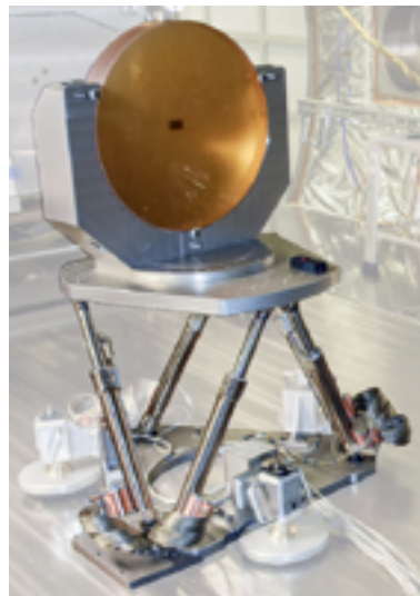
ZONDA Hexapod in a vacuum chamber with a mirror for optical calibration at Thales Alenia Space.