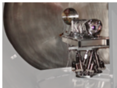
This ZONDA S positions a coronagraph in order to characterize it in a vacuum chamber at Liege Space Center (GSL).