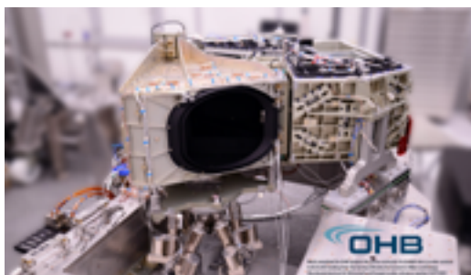
This ZONDA S hexapod aligns two parts of a space telescope in an ISO5 clean room.