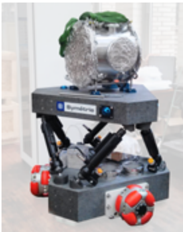
JORAN hexapod size has been adapted to the beam height of the Australian Synchrotron.