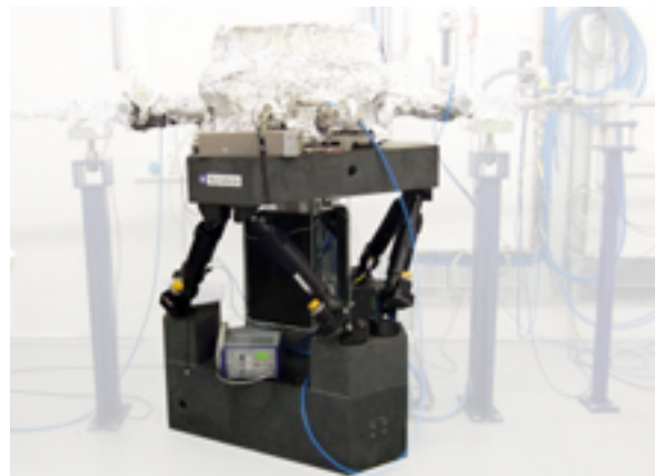
JORAN hexapod has been developed in collaboration with ESRF synchrotron to position mirrors with very high resolution.