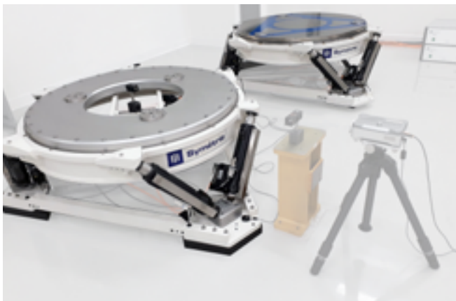
Customized JORAN hexapods with extra Rz rotations calibrate the segments of the primary mirror of ESO ELT telescope at Safran REOSC.